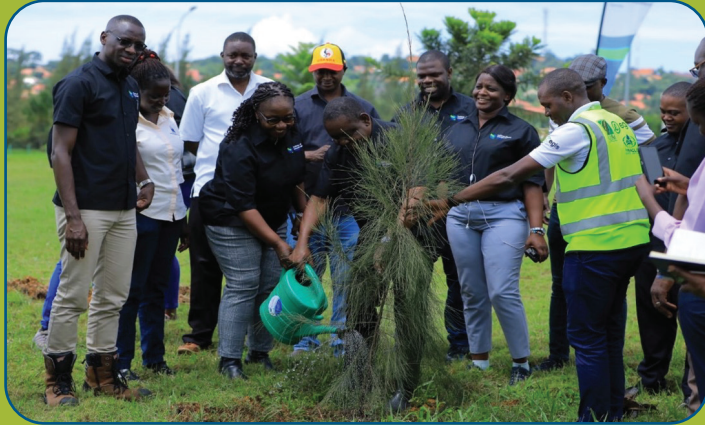
The IIA Uganda led by the President took initiative in a tree planting drive on 24th May 2024. The trees were planted along the Kampala Entebbe Express Highway to mark Internal Auditors' effort in preserving the environment for Now and the Future.