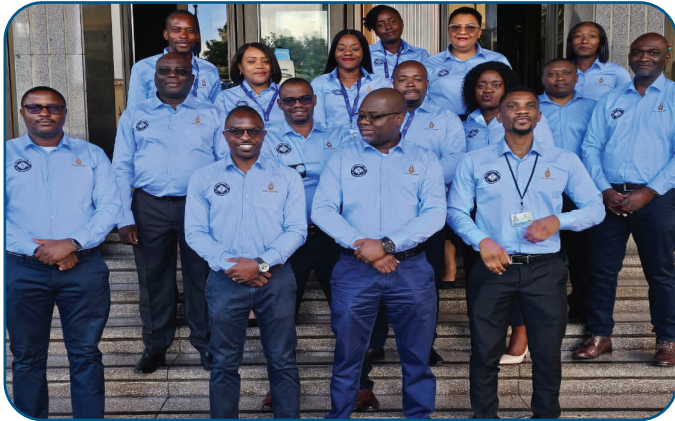
The Bank of Zambia staff celebrating the awareness month