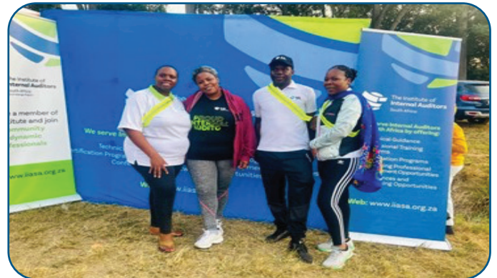
The IIA SA Mpumalanga Region followed the IIA SA national theme: Brave Hearts and hosted a wellness day for the Internal Auditors in the region.