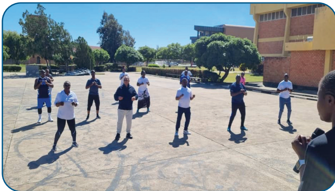
The aerobics during the sports awareness day in May 2024