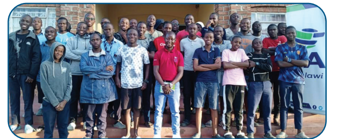
Internal Audit Career Talk at Marist Boys Secondary School held on 24th May 2024.