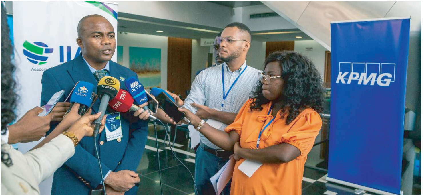
The IIA Angola President in interview by media reporters advocating Internal Audit profession. It was held on 22nd May 2024 in Luanda, Angola.