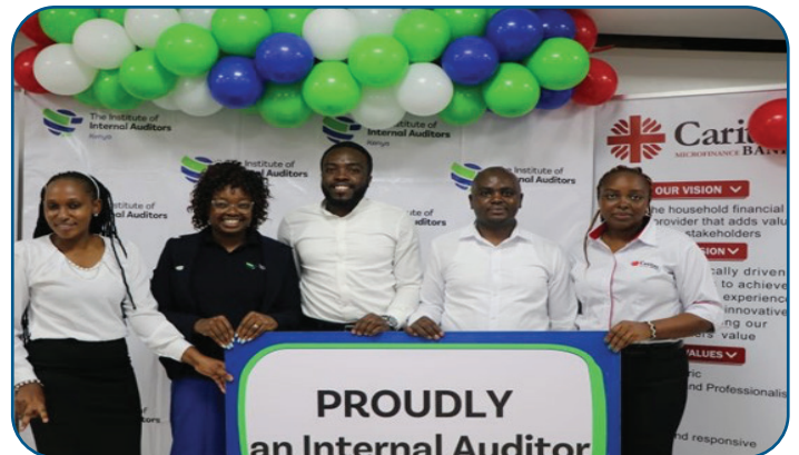
Joyfully celebrated the positive impact of the internal audit at Caritas Microfinance Bank with a delicious cake. It was a delightful occasion to recognize the invaluable contribution of internal audit to the organization.

The IIA Kenya collaborated with Chiromo Hospital Group for a webinar on Mental Health in the workplace since May happens to be both Internal Audit Month and Mental Awareness Month, globally.