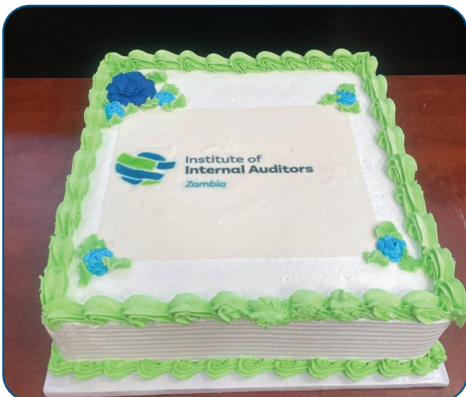
The cake shared by the participants after awareness activities in May 2024.