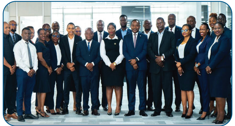
The IIA Tanzania and NMB Bank Teams celebrating the Internal Audit month.