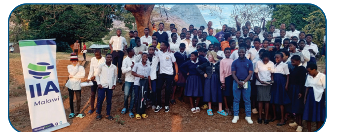
Internal Audit Career Talk at Phalombe Secondary School in Southern Malawi on 10th May 2024.