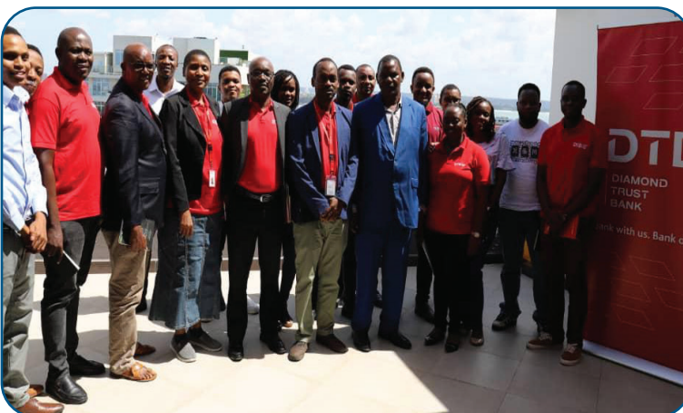
The IIA Tanzania and DTB Bank Teams celebrating the Internal Audit month during a learning session held on 24th May 2024.