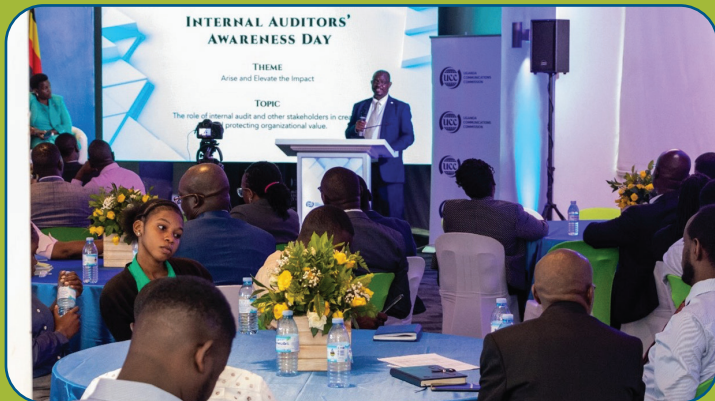
The Internal Auditor General of Uganda addressed staff of Uganda Commission on the benefits of embracing the value of internal audit to the various departments within the organization.