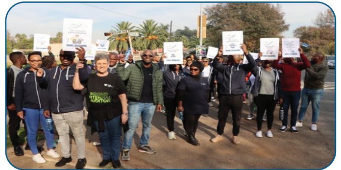
The IIA SA National Office brought the Awareness by coordinating a wellness walk in the Bedfordview area of Johannesburg which all members were invited, Themed: Brave Hearts. City of Ekurhuleni members in internal audit came in numbers to support this initiative.