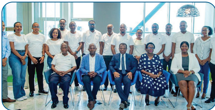
The IIA Tanzania and CRDB Bank Teams celebrating the Internal Audit month during a learning session held on 24th May 2024.