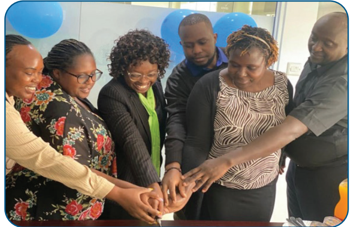
Cake Cutting at Institute of Internal Auditors Kenya - IIA Kenya in celebrating the Internal Audit Month. Internal Auditing adds Value by providing assurance, insight, and objectivity.

Celebrating the internal Audit month at the KQ Offices. Internal auditing is an independent evaluation of an organization's internal controls to help manage risks and achieve objectives.