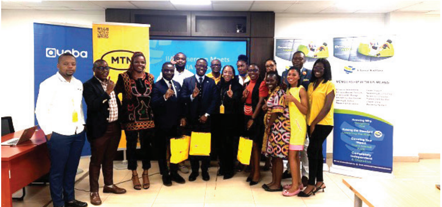
The IIA Cameroon Leaders and the MTN Telecom representatives during the stakeholders' engagement meeting aimed at creation of awareness of Internal Audit and setting a platform for partnership.