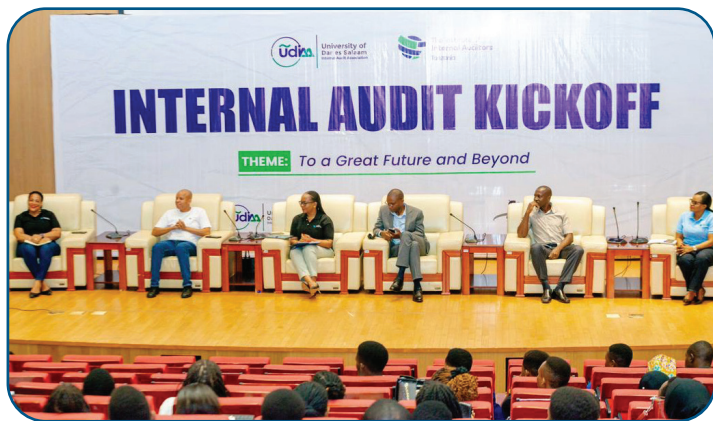
The IIA Tanzania in collaboration with the Internal Audit Association held a Forum themed To a Great Future and Beyond at the University of Dar Es Salaam.