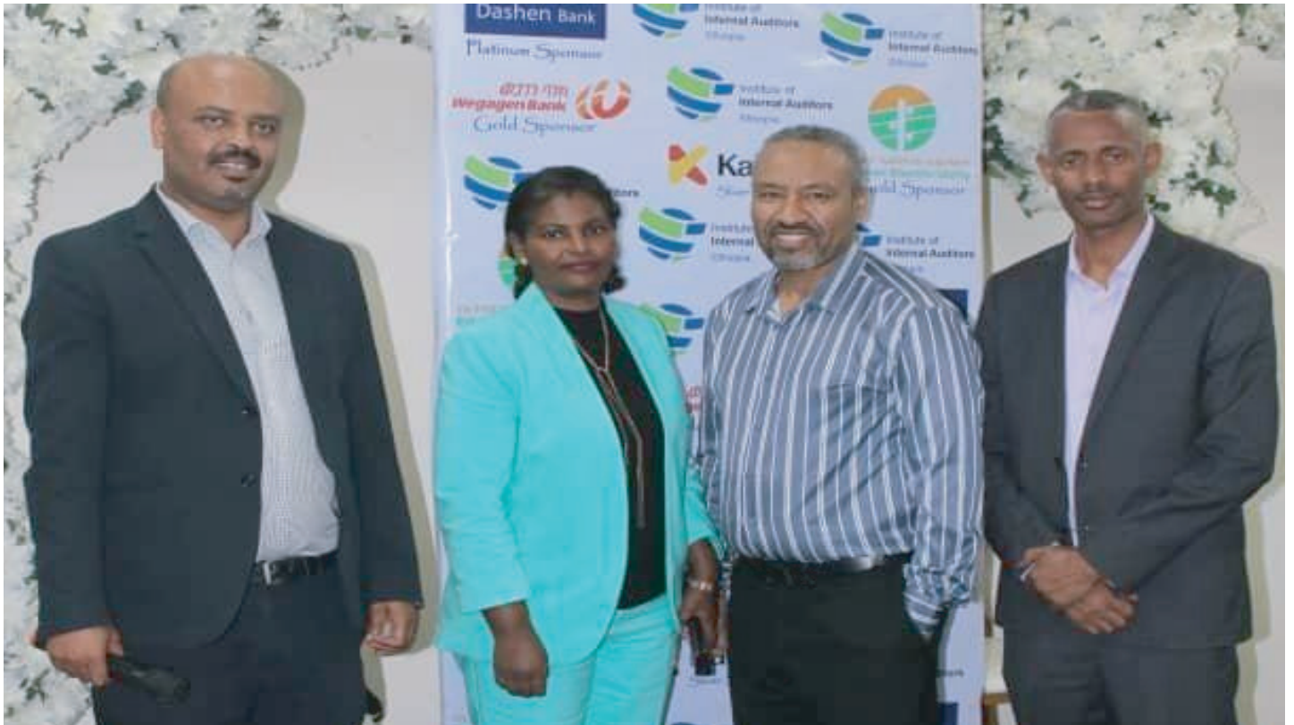
The IIA Ethiopia Board members during the Internal Audit Forum held on 22nd June 2024 at Chack Inn Hotel in Addis Ababa, Ethiopia