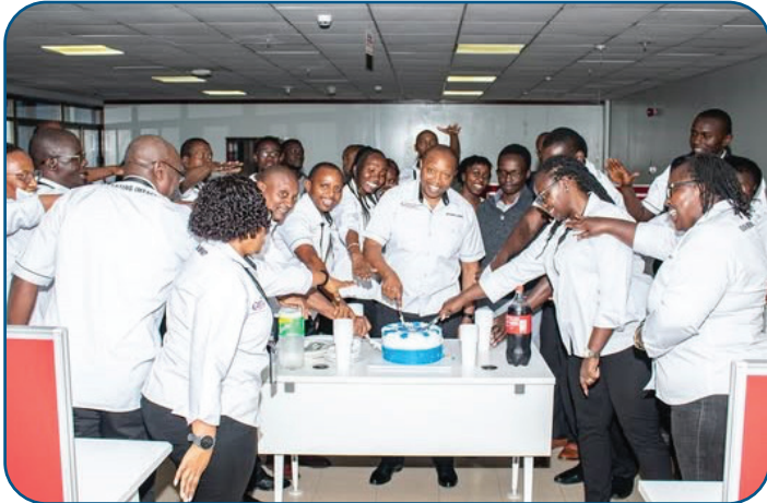
The KRA team celebrating the Internal Audit month. Internal auditing involves identifying the risks that could keep an organization from achieving its goals, ensuring the organization's leaders know about them, and proactively recommending improvements to help reduce the risks.