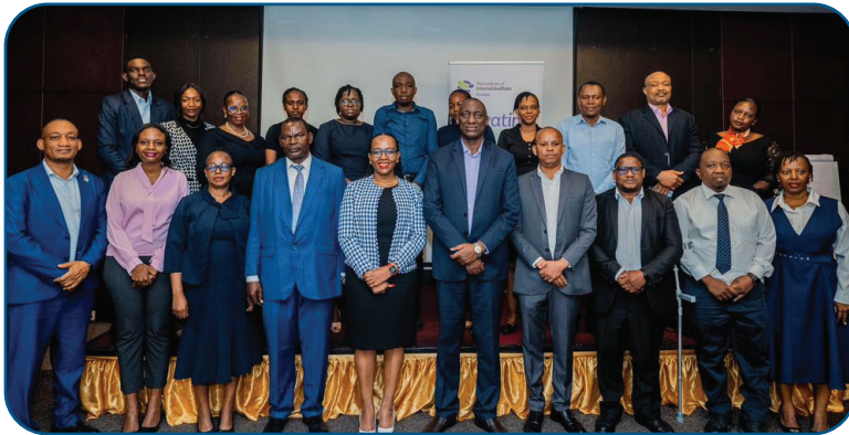
Chief Audit Executives (CAE) Forum on Strengthening Governance Oversight: The Vital Role of Internal Auditors held on 23rd May 2024 in Dar Es Salaam.