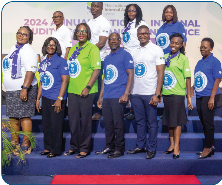
The IIA Ghana Leadership demonstrating Internal Audit Awareness month during the Internal Audit Governance Forum held in May 2024.