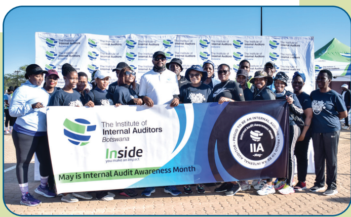
Awareness Walk at destination in Gaborone.