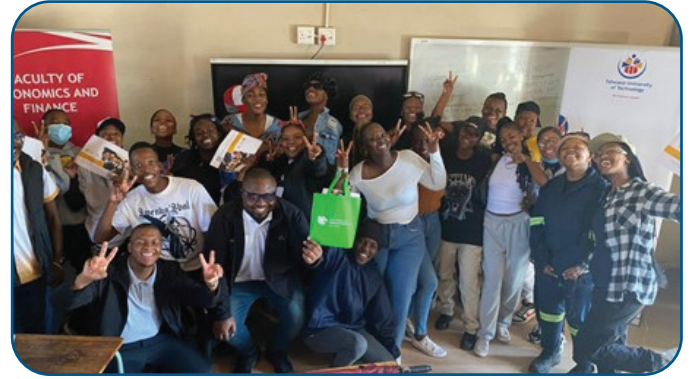
The IIA SA Pretoria Region celebrated the awareness by going to the Tshwane University of Technology to bring awareness around Internal Audit as a career option.