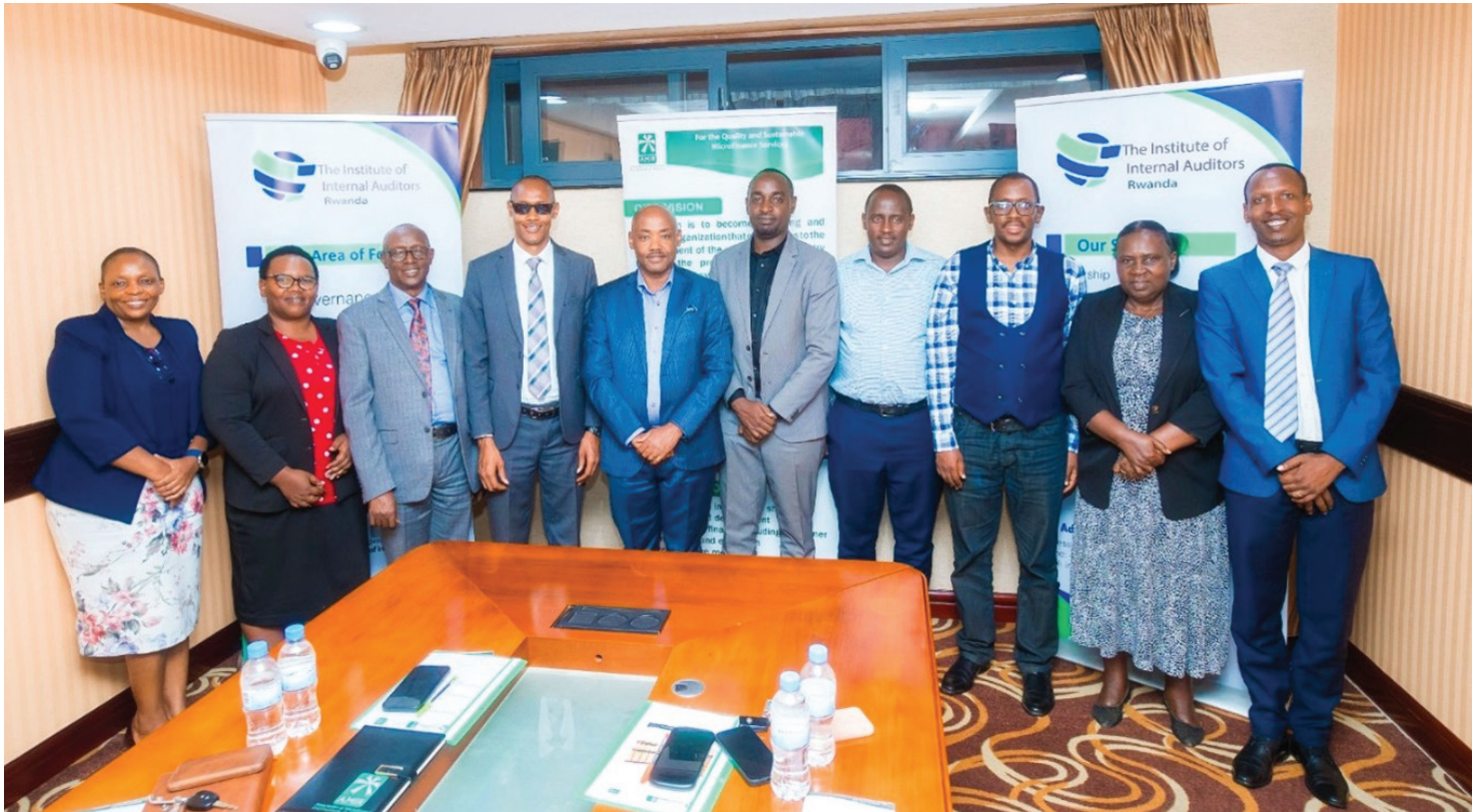
Board Members of the Institute of Internal Auditors (IIA) Rwanda and Secretariat of the Association of Microfinance Institutions in Rwanda (AMIR) during the signing a Memorandum of Understanding (MoU) aimed at bolstering the capacity of professionals within the microfinance sector.