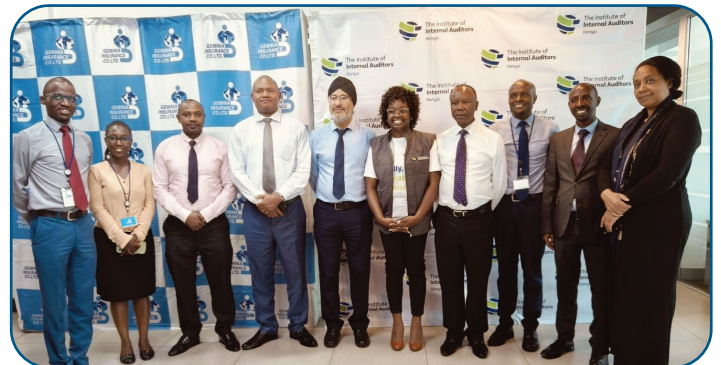
Celebrating Internal Audit Month with Geminia Insurance! The event featured special cake cutting and photo frame moments.