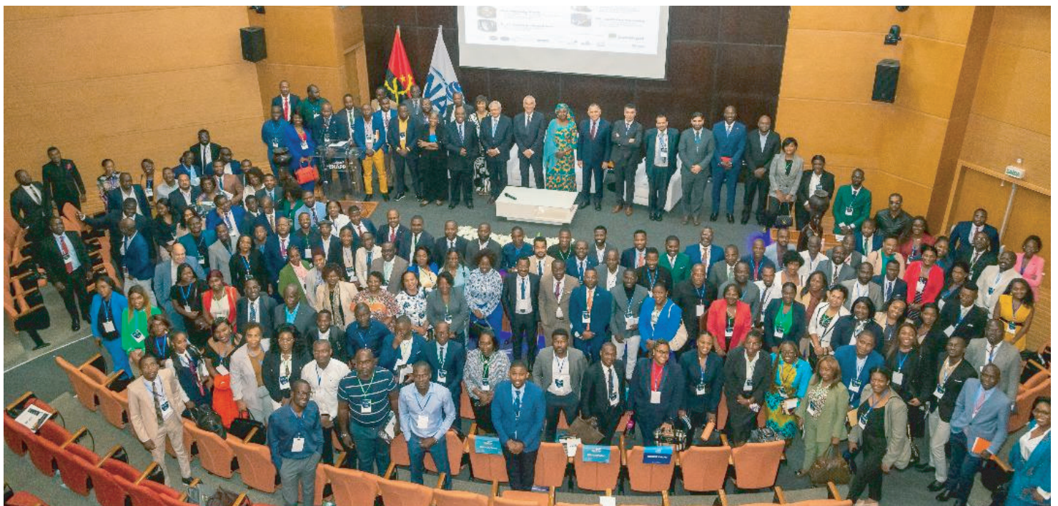
On 22nd May 2022, IIA Angola held its Annual Conference that included that among other things, conveyed internal Audit message to stakeholders.