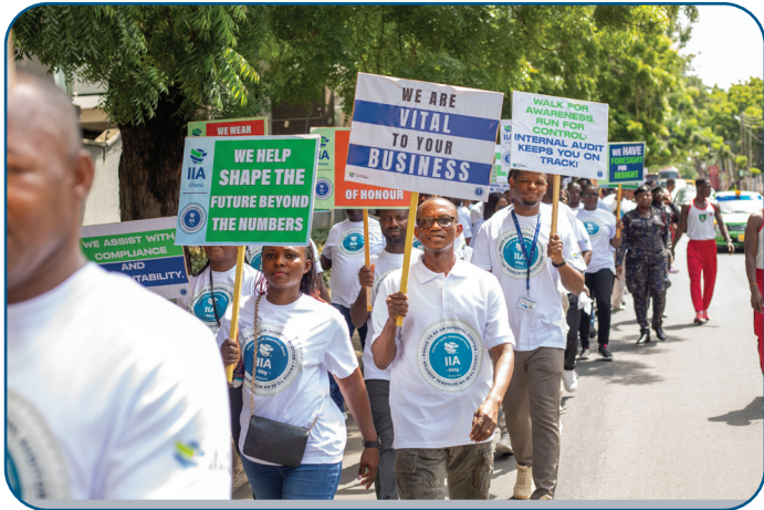
Internal Audit Awareness Walk held in Accra, Ghana.