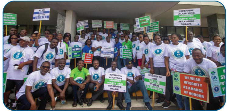
Participants of the Internal Audit Awareness Walk at destination.