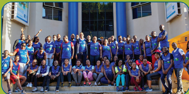
Housing Finance staff after a run during the Internal Audit Awareness month.