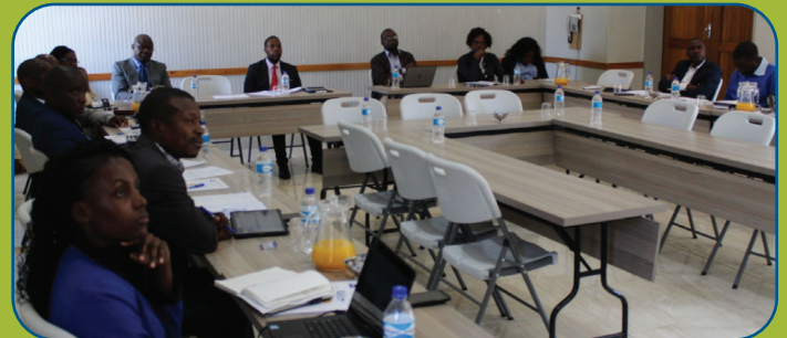
The IIA Zimbabwe on the 17th of May 2024 hosted a Stakeholder Engagement Meeting with the Academia! Participants from the major Universities were in attendance as the Institute presented them with a platform to exchange knowledge and ideas aimed at creating awareness and supporting growth of the Internal Auditing Profession. The enthusiasm from participants has inspired the Institute to explore more options that will drive internal audit knowledge dissemination and increase enrolments of new entrants into the profession