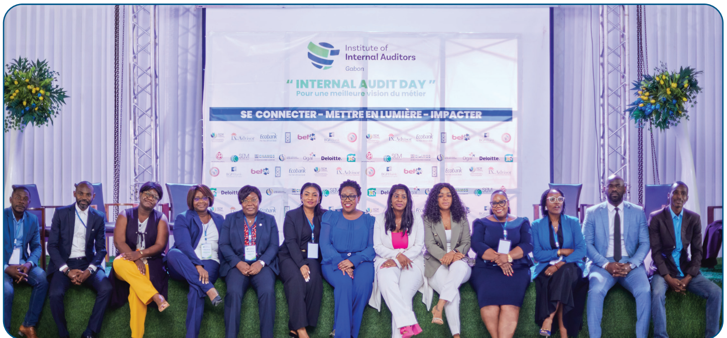
The IIA Gabon Leaders and stakeholders during the Internal Audit Day Forum.

On 30th May 2024, at the Nomad Hotel from 9 a.m. to 3 p.m., Internal Auditors, External Auditors, Service Inspectors, Verifying Inspectors, Internal Controllers, Consultants, Associates, General Managers, Teachers, Risk Managers, Students, professionals from other control functions, quality and operational auditors, met as part of the INTERNAL AUDIT DAY organized by IIA GABON as part of the celebration of Internal Audit month. The Forum themed "CONNECT - HIGHLIGHT – IMPACT", provided opportunity for professionals, faculty and students to discuss new standards and the adequacy of school training and business needs.