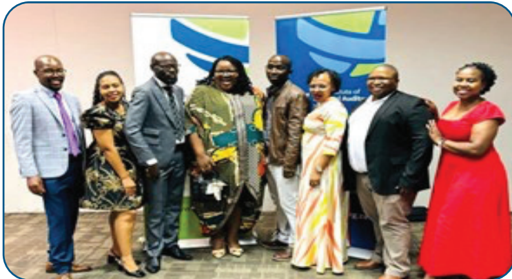
The IIA SA Border Kei and Gqeberha regions in collaboration with Eastern Cape Provincial Region had a big session with close to 150 attendees to also bring awareness to all stakeholders in the public sector.