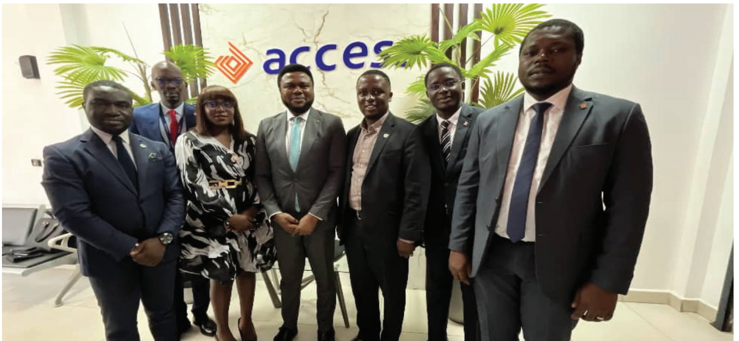
The IIA Cameroon Leaders and the Access Bank Team during the advocacy visit at the Access Bank Office in Cameroon.