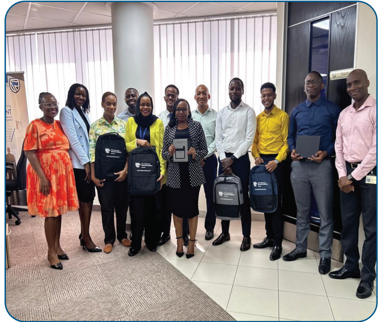
The IIA Tanzania and Stanbic Bank Teams celebrating the Internal Audit month.