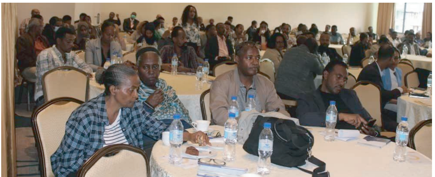
On 22nd June 2024, The IIA Ethiopia organized a forum that attracted more than 150 participants (IA professionals and stakeholders) who discussed among other things, the New IA Standards.