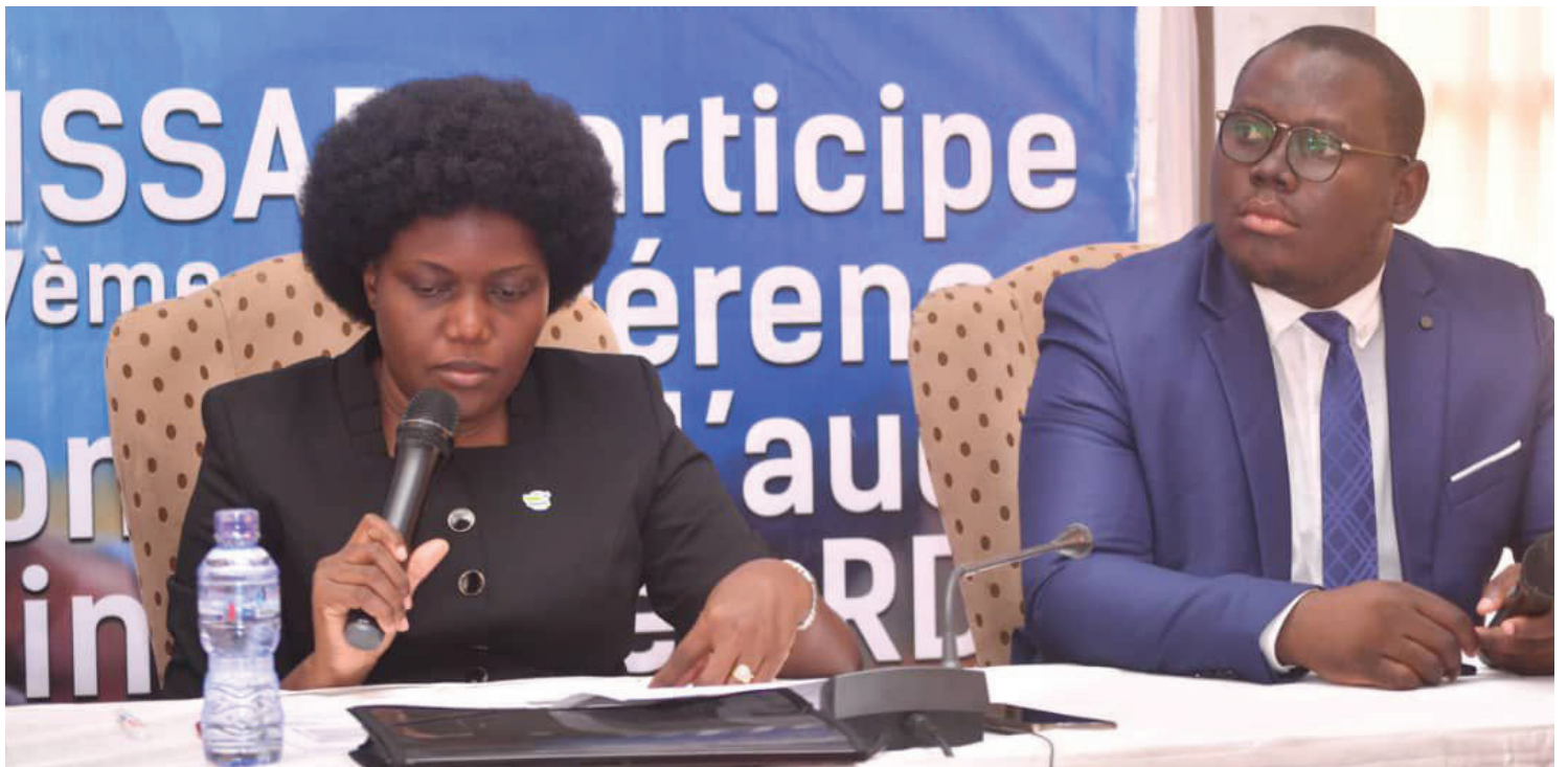
AFIIA Chairman speaking at the IIA Congo Conference during one of her regional advocacy visits.