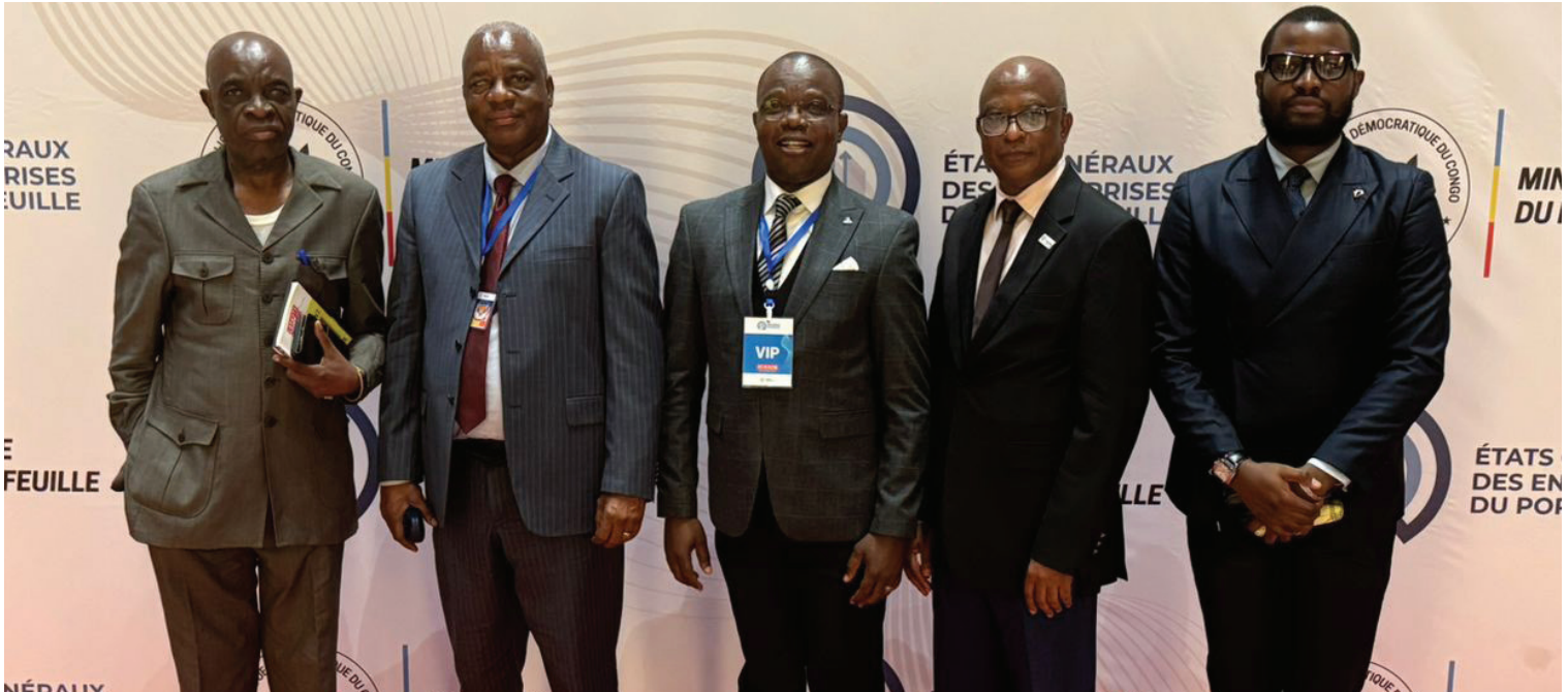
The IIA Congo Leaders and Government representatives during the meeting with the Association of the Congolese Public Enterprises at which IIA Congo raised awareness on the New Internal Audit Standards.