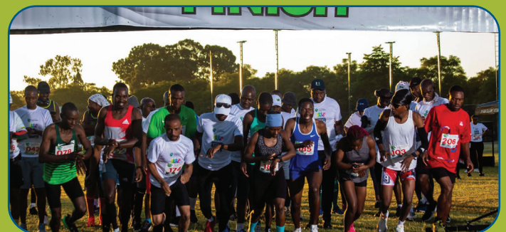
The IIA Zimbabwe celebrated Internal Audit Month globally in May by holding their first Wellness Day on Saturday, 18 May 2024. The aim was to build a connected community of internal audit professionals and stakeholders. The event included a marathon to showcase the resilience of internal auditors and their ability to provide valuable insights and foresight for organizations.