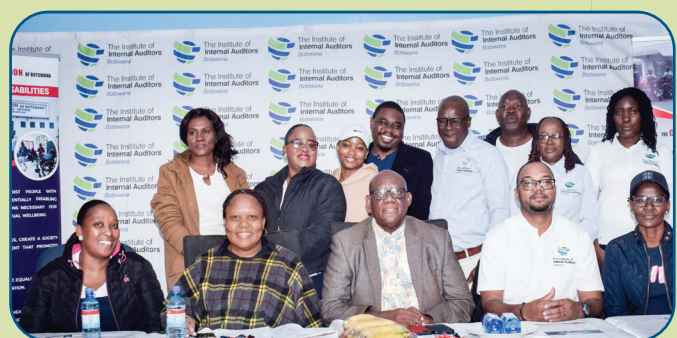
The IIA Botswana representatives and Cheshire Foundation leadership.

The IIA Botswana on the 1st of June 2024, handed over Donations that were made to Cheshire Foundation by Members and Stakeholders. Cheshire Foundation exists to assist people with disabilities by providing conditions necessary for their physical, mental, social and spiritual wellbeing. In the spirit of Internal Audit Awareness Month, the IIA decided to partner with its Members and Stakeholders to contribute and assist Cheshire Foundation.