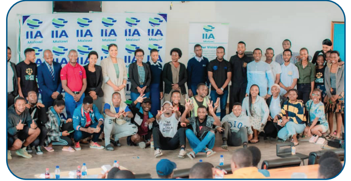
Internal Audit Day at the Malawi University of Business & Applied Sciences (MUBAS) held on 4th May 2024.