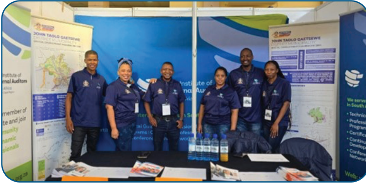
The IIA SA Northern Cape Region in partnership with the Northern Cape Provincial Treasury celebrated the Internal Audit May Awareness with a networking session.